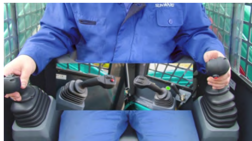
Operation with pilot handles

Optimized structure designation enable machine to have higher lifting height than other brand.