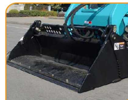
4 in 1 bucket